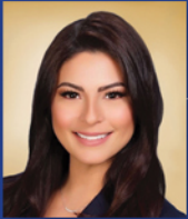
MAYOR CHRISTI FRAGA

Christi.Fraga@cityofdoral.com 305-593-6725 x7000