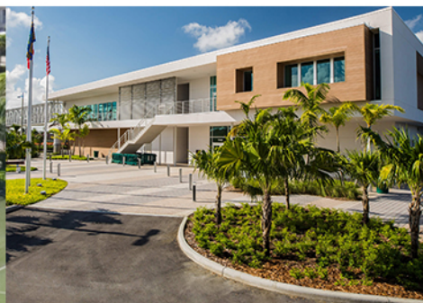
Doral Legacy Park