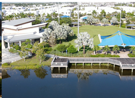
Doral Glades Park