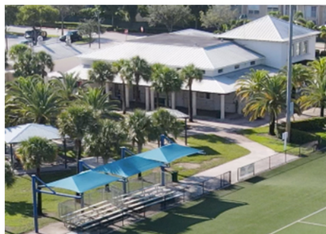
Morgan Levy Park

To register, visit the park your child will be attending.