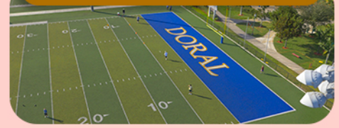
Doral Meadow Park