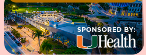
Doral Cultural Arts Center