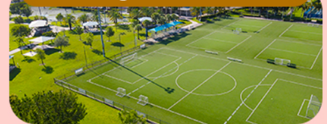
Morgan Levy Park