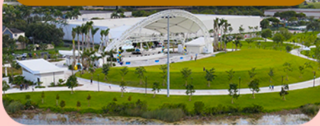
Doral Central Park