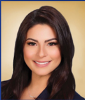
MAYOR CHRISTI FRAGA

Christi.Fraga@cityofdoral.com 305-593-6725 x7000