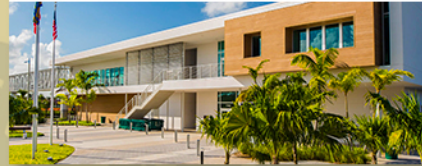
DORAL LEGACY PARK