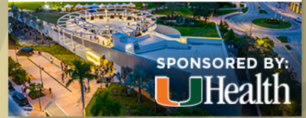
DORAL CULTURAL ARTS CENTER