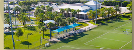
MORGAN LEVY PARK