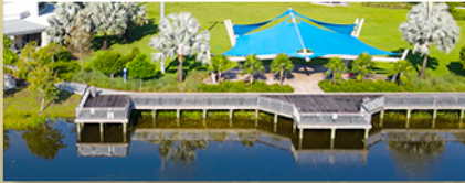
DORAL GLADES PARK