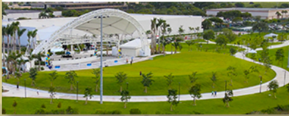
DORAL CENTRAL PARK