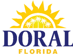
Exhibit “G” – PROGRAM ASSESMENTS

There are Quality Assessments every three months. These Assessments will evaluate the quality of the program, how enjoyable it is for the participants, and how efficiently the program is being run by the provider.