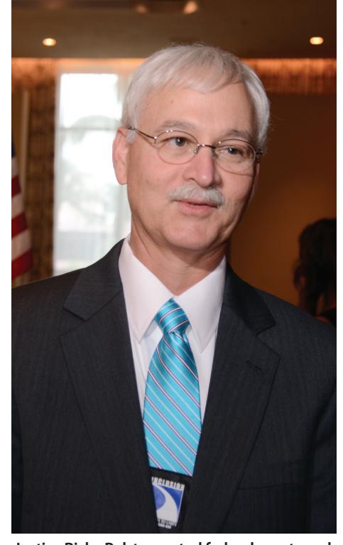
Justice Ricky Polston noted federal courts and 36 states already follow the Daubert standard.

" The concerns were not discussed in detail in the opinion but touched upon the constitutional right to a jury trial and denying access to the courts.