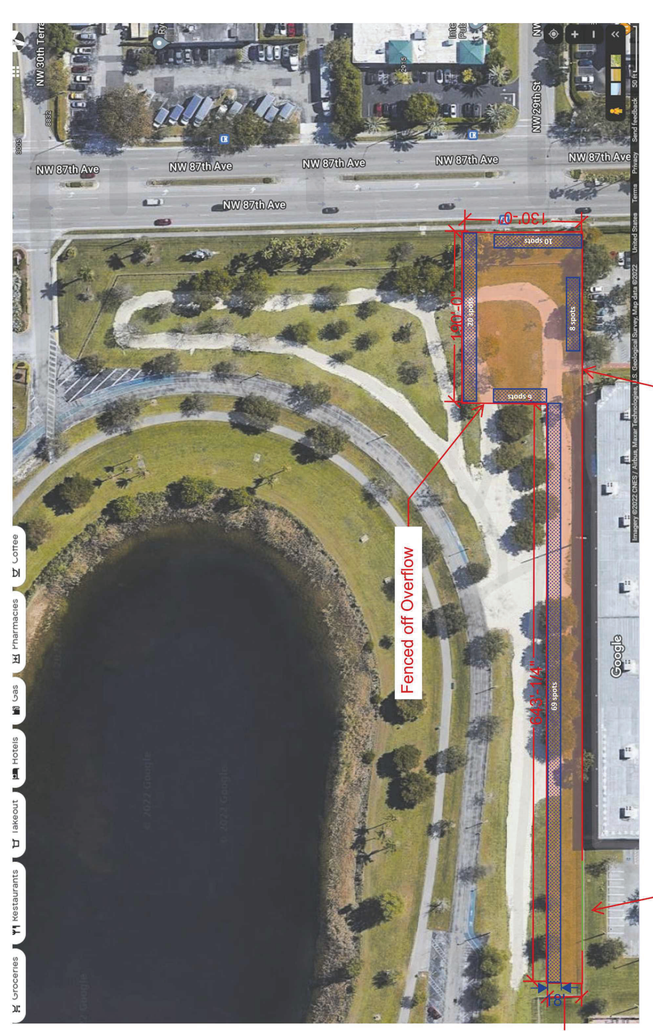
~113 parking spaces (Parking areas in blue, 20' drive lane)