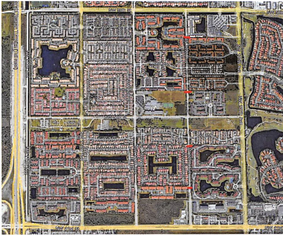
Figure 2 NW 109 th Avenue corridor between NW 41 st Street and NW 58 th Street