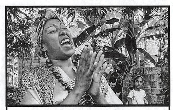
The New York Times

"The kind of group that world-music fans have always been thrilled to discover: