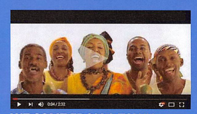
WE COME FROM A TOWN... 2017. Band's first visit to the US video.