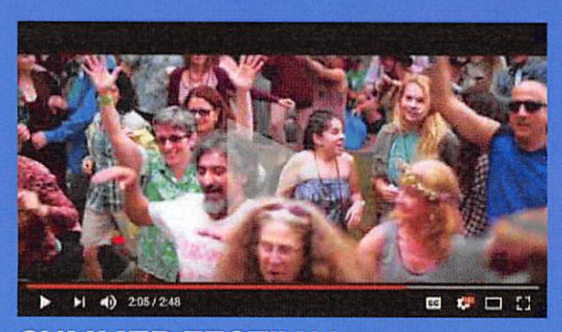
SUMMER FESTIVAL 2016. Audience interaction in Canada.