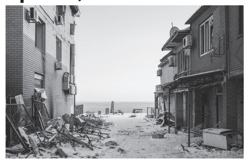
After fleeing their cities, top lawyers have completely ceased their normal operations and are instead wielding their network of international business contacts to funnel military, logistic and financial resources into the country.