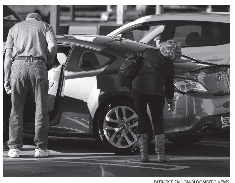
President Donald Trump has suggested seeking new tariffs of 20 to 25 percent on automobile imports.