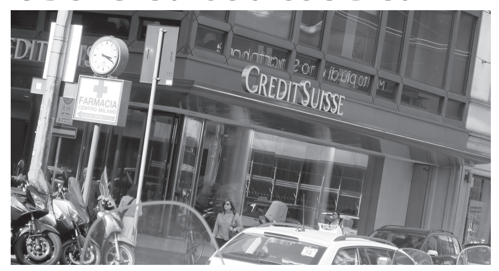
Given that the merger has been met with little public enthusiasm and it's an election year, parliament is trying to curtail government powers in the future.