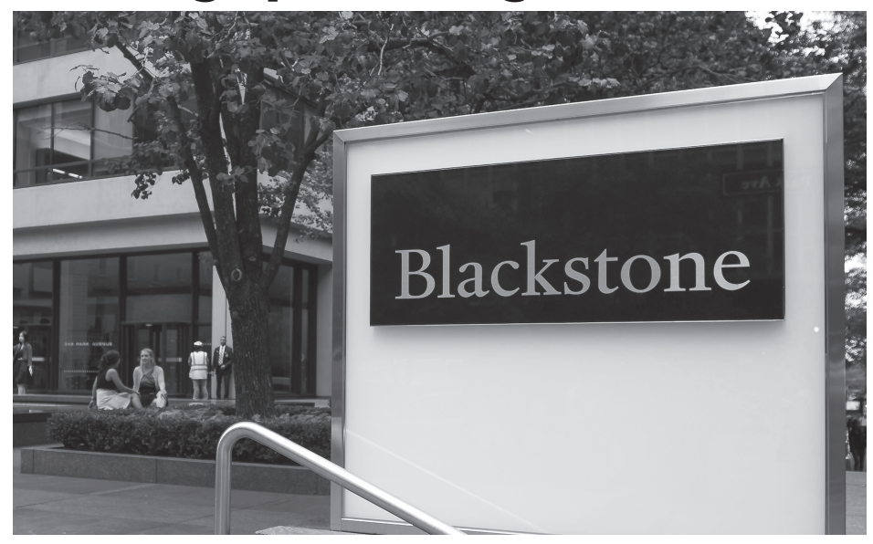
As recently as June, a group led by Blackstone provided about $5 billion of debt, one of the biggest seen in direct lending, to help fund the leveraged buyout of software maker Zendesk.