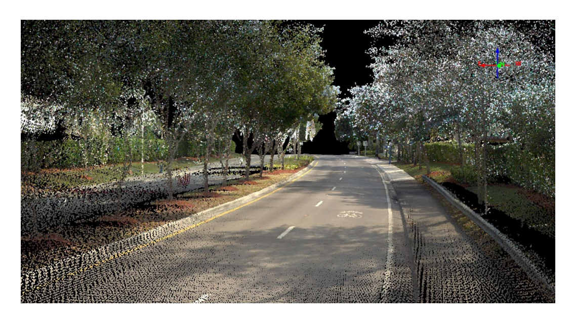
Digital Twin - Point cloud analysis 3d model, measurements accuracy 2 cms