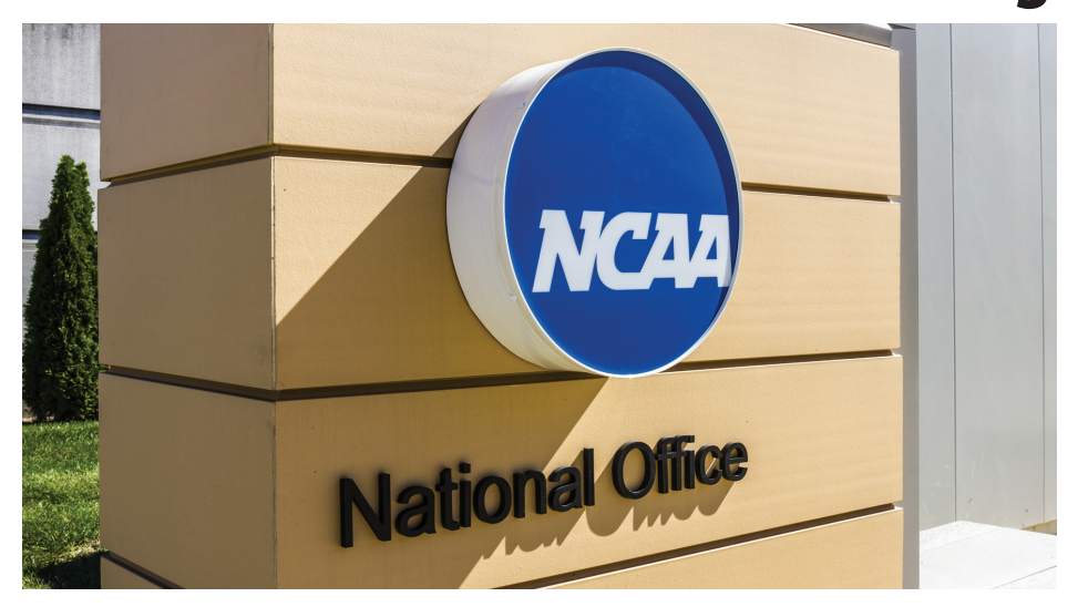
A U.S. District Court judge barred the NCAA and its member schools and conferences from capping education-related benefits such as computers, science equipment, postgraduate scholarships, and aid to study abroad to the athlete plaintiffs.