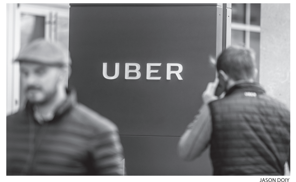
The SoftBank-led group will end up owning roughly 17.5 percent of Uber, with SoftBank at 15 percent holding the largest stake.