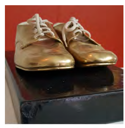
All this and heaven too