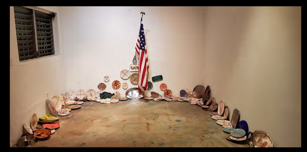
Between two waters Unification of states, Miami Artistic collaboration with Loundromat Art Space, Edge Zones Art Space. Inburgering Art.