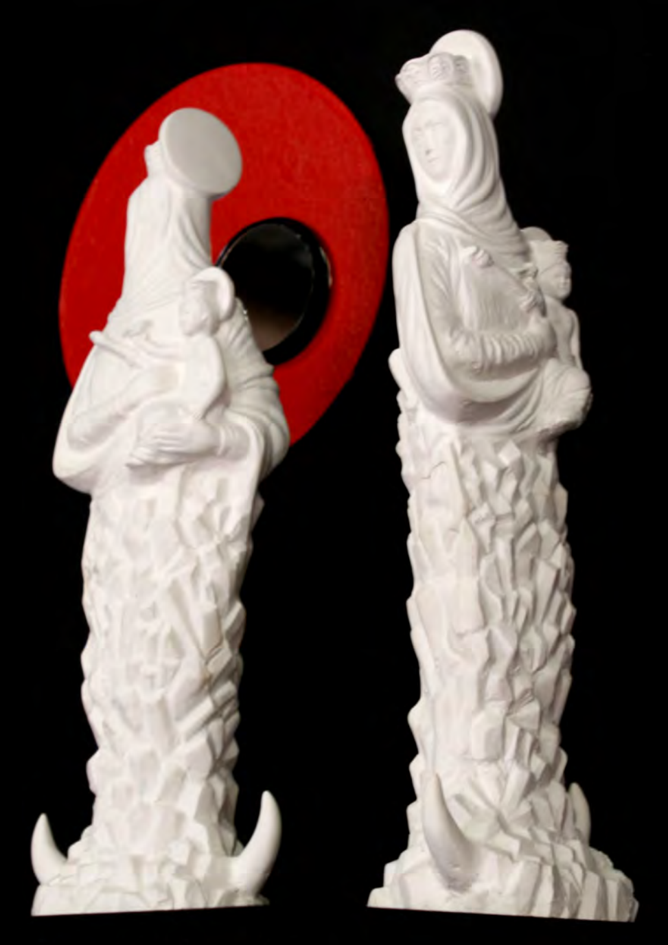
Trilogia Surrealista Maracucha. MACZUL. Maracaibo Venezuela Inburgering Art.