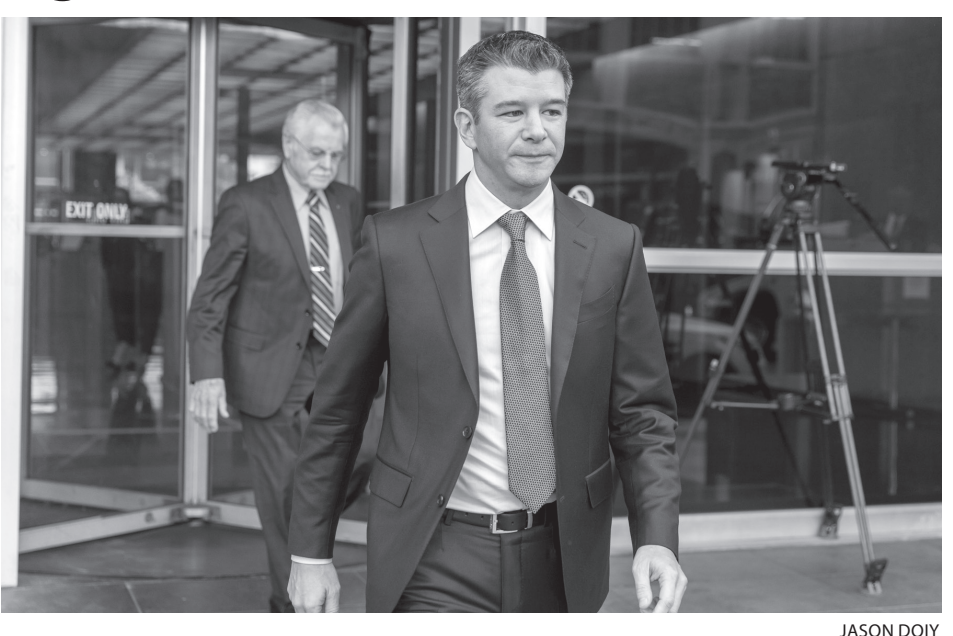
Former Uber CEO Travis Kalanick is plotting an aggressive growth strategy to support a burgeoning kitchen rental service called CloudKitchens.