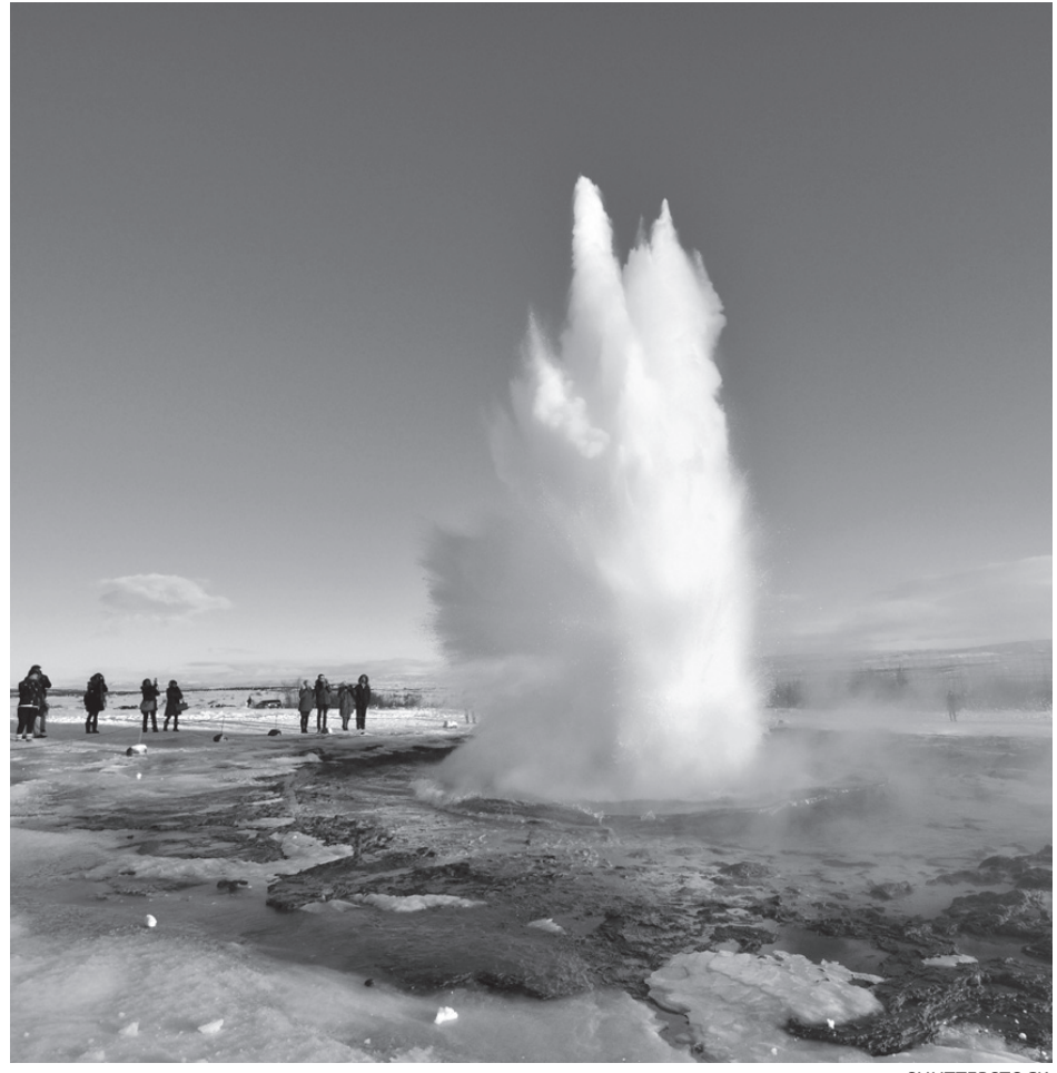
Tourism is now Iceland's No. 1 export, thanks in part to its location for scenes featuring in James Bond movies and the TV series "Game of Thrones."