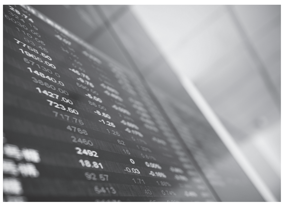
Markets are pricing in a strong likelihood that the Federal Reserve will raise borrowing by a quarter-point May 3 to contain inflation, after U.S. payrolls rose at a firm pace last month and the unemployment rate dropped.