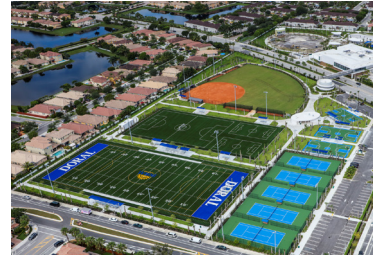
Doral Legacy Park (18 acres)