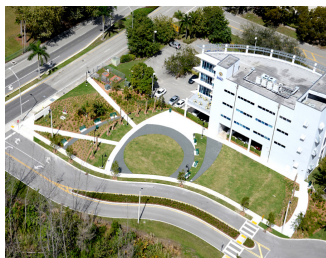
MAU Park (.68 acres)