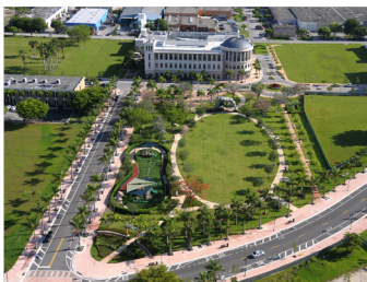
Downtown Doral Park (3 acres)