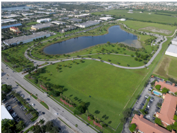
DORAL CENTRAL PARK CLOSED FOR CONSTRUCTION