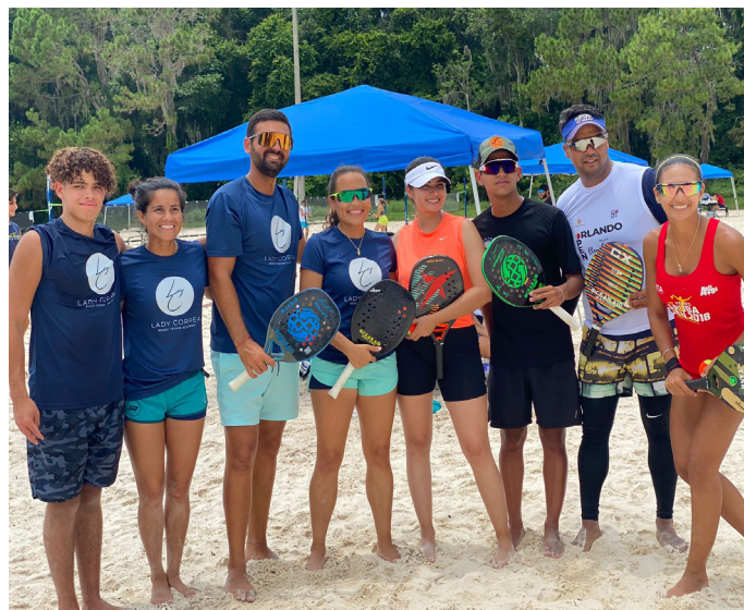
Beach Tennis Program