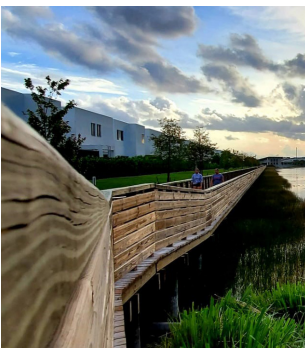
Capture Doral Parks Photo Exhibit Submission