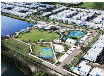
Doral Glades Park (25 acres)