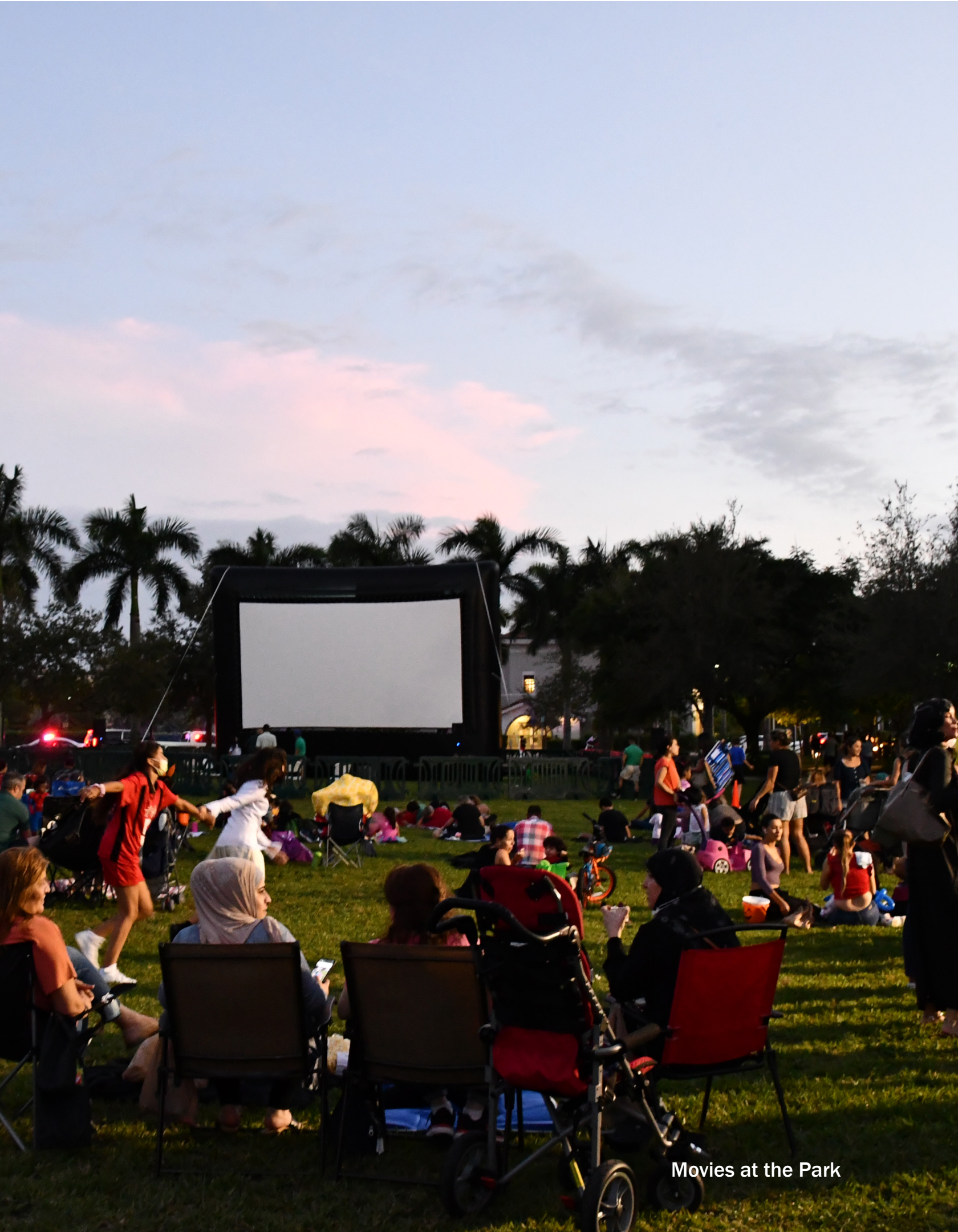
Movies at the Park