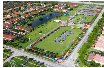
Trails & Tails Park (8.3 acres)