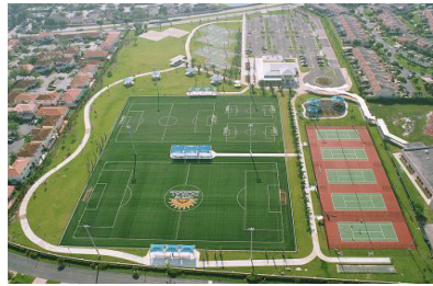
Morgan Levy Park (14 acres)