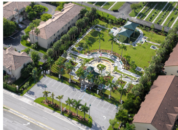
Veterans Park (1.3 acres)