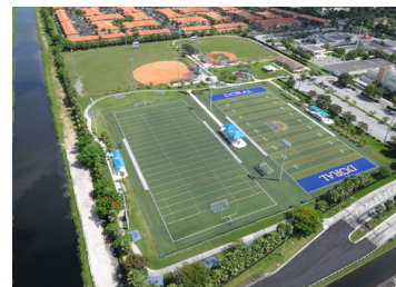
Doral Meadow Park (14 acres)