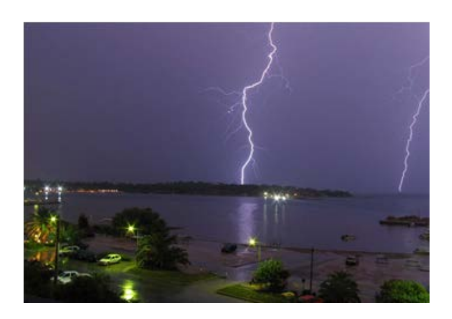
2016 Severe Weather Awareness Week